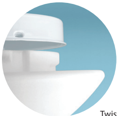
Twist and lock bayonet glass