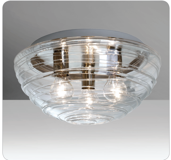
WAVE 15 CEILING SHOWN IN CLEAR (906361C)

UL or ETL Listed. Suitable for Damp Locations (interior use only).